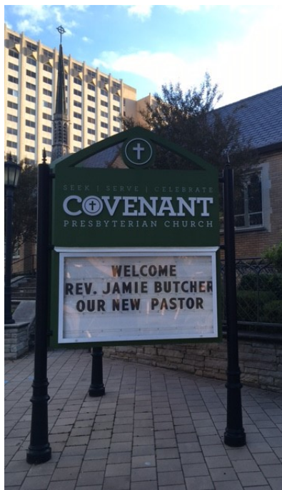
I was grinning with excitement when I took this photo and texted it to Jamie!