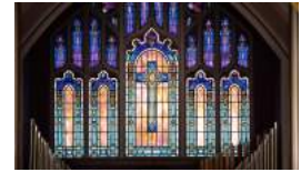
SPOTLIGHT ON HVAC: PROJECT NEARS COMPLETION