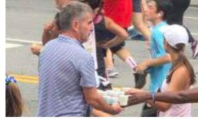
SERVE WITH COVENANT THIS SEASON