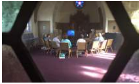
LIFELONG LEARNER OPPORTUNITIES AUG, SEPT, OCT