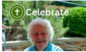
WE HAD A BLAST! CHECK OUT OUR SUMMER PICTURES